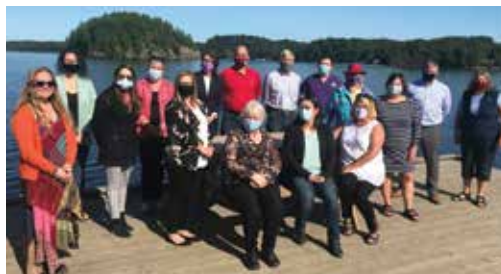
Muskoka 2020 ECSF Recipients