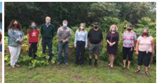
Parry Sound 2020 ECSF Recipients

705-646-1220 | PO Box 35, Bracebridge ON, P1L 1T5