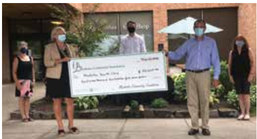
2020 Muskoka Stay At Home Gala Grant Recipients

Granting in 2020 = $442,718.00 | Granting in 2021 = $266,122.00