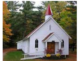
Norway Point Community Church

In the spring and summer of 2020 the Muskoka Community Foundation also participated in the Emergency Community Support Fund (ECSF), a national granting program that assisted local charities pivot their services during the pandemic. In total ECSF awarded $268,560.00 to 30 charities serving the Muskoka and Parry Sound Districts.