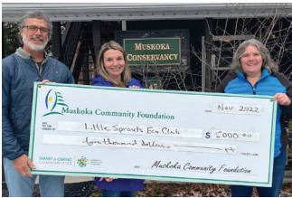
Patricia’s Fund - Little Sprouts Eco Club