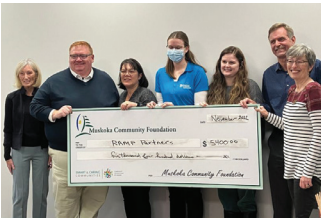
RAMP Fund Grant Recipients