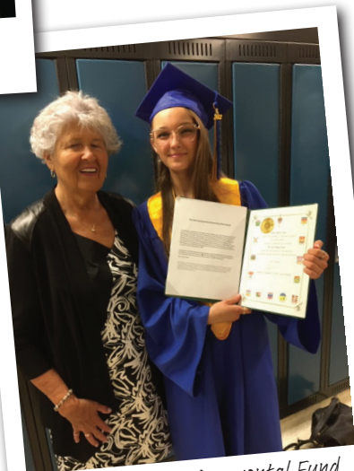
Stan Darling Environmental Fund