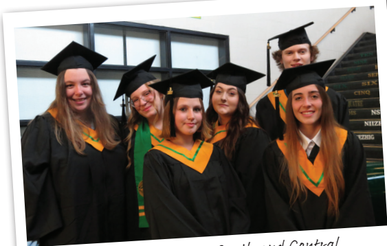
2022 Graduates – South and Central Almaguin Education Fund