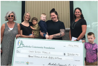
Patricia’s Fund - One Kids Place